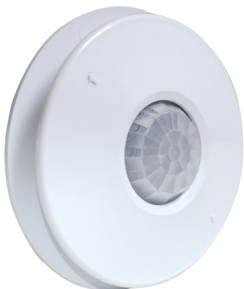
RECESSED MOUNT CONFIGURATION