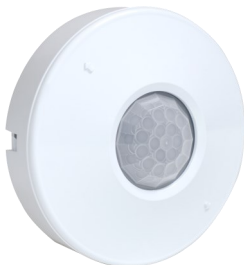
SURFACE MOUNT CONFIGURATION